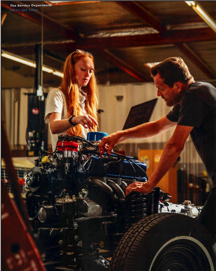
The Service Department Parts and Labor