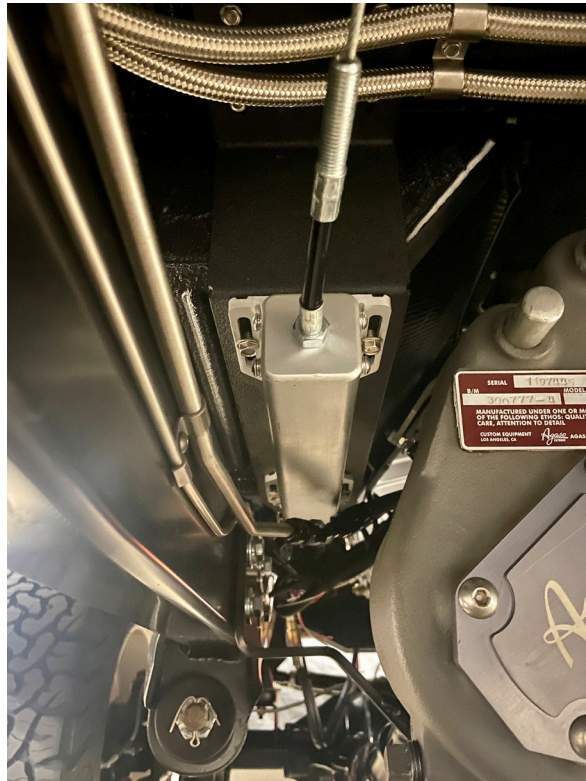
View of driver side, from rear looking toward front of vehicle.